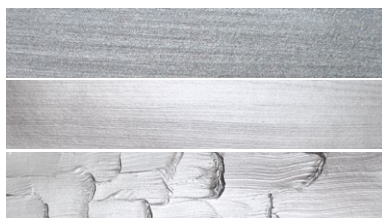
197 Brilliant Silver PBk7 PW6/PW15/PW20